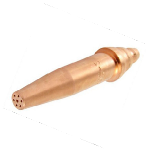
Oxy- Acetylene cutting nozzle