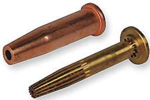
Oxy- Propane cutting nozzle

Cutting require different cutting attachments and cutting nozzles