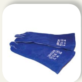
WELDERS GLOVES, 6 PAIRS Product number: 632786