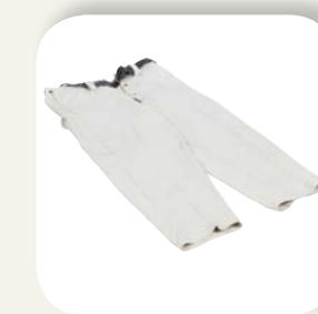
LEATHER TROUSERS W/BELT Product number: 633016