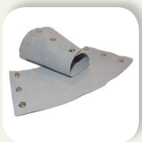
LEATHER CUFFS PAIR Product number: 175935