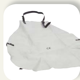
LEATHER APRON F/WELDING Product number: 510420