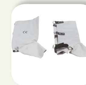
LEATHER SPATS, PAIR Product number: 510453