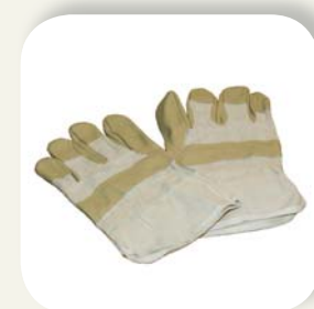
WORKING GLOVES, 12 PAIRS Product number: 633057