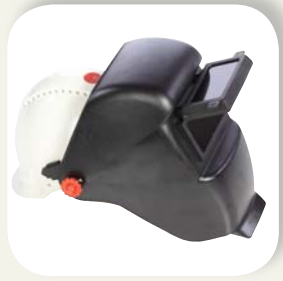
SAFETY HELM W/FACE SH. Product number: 619114