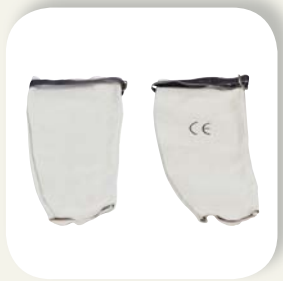
ARM PROTECTOR PAIR Product number: 184184