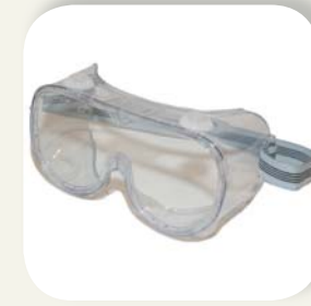
SAFETY GRINDING GOGGLES Product number: 653410