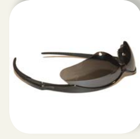
SAFETY SPECTACLES SHADE 4 Product number: 632950