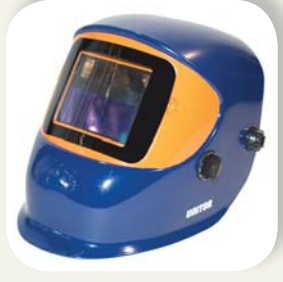
AUTOVISION PLUS WELDING SHIELD Product number: 767001