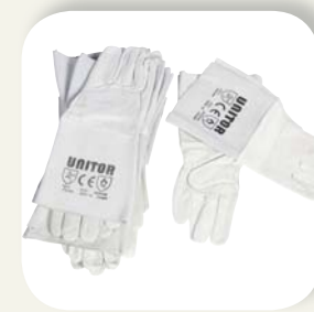
TIG GLOVES, 6 PAIRS Product number: 632794