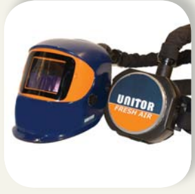
AUTOVISION PLUS FRESH AIR WELDSHIELD Product number: 767000

Do not operate equipment for welding or related thermal processes unless you are thoroughly familiar with the process, the equipment, rules and regulations related to the process and equipment; including proper use of accessories, e.g. fire extinguishers. Preparation for hot-work onboard should include, without being limited to, the points below to ensure safe operation.