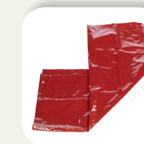
WELDING CURTAIN W/HOOKS Product number: 633065