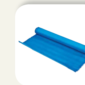
WELDING SPATTER BLANKET 1 X 10M Product number: 646067