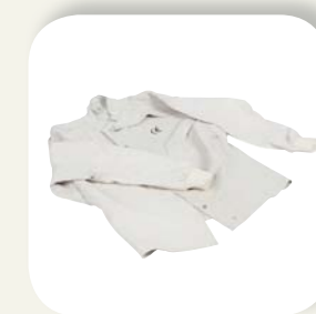
LEATHER JACKET X-LARGE Product number: 510446