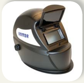
FLIPVISION WELDING FACE SHIELD Product number: 709485