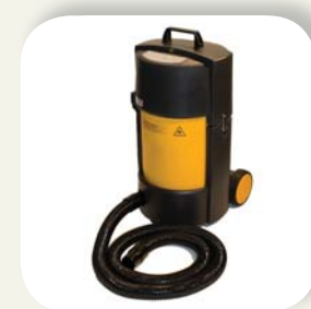
FUMECLEAN-230 WELD. FUME EXTRACTOR Product number: 735878