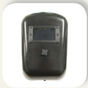
FACE SHIELD W/HANDLE Product number: 619098