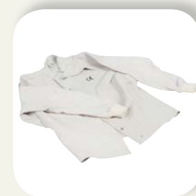
LEATHER JACKET LARGE Product number: 510438