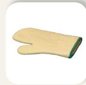
HEAT RESISTANT MITTEN Product number: 233148