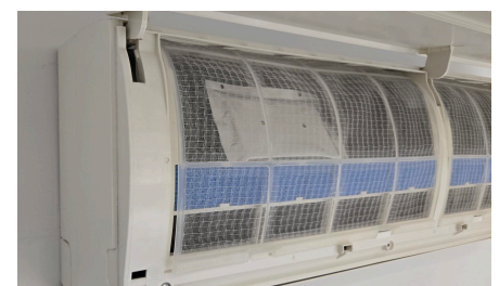
A/C Unit Air Treatment in Wall-mounted Unit