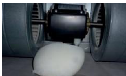
Duct Air Treatment in Ducted Unit