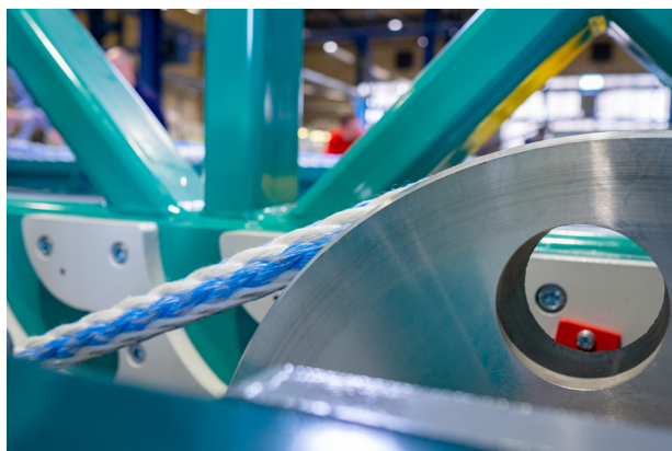
Figure 2. Abrasion testing is performed in-house at Timm.