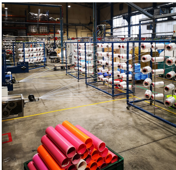
Figure 1. Timm ropes are designed, developed and produced in the Timm factory in Slovakia.

Celebrating its 50 th anniversary this year, the Oil Companies International Marine Forum (OCIMF) is a voluntary association focused on preventing harm to people and the environment by promoting best practice in the design, construction and operation of tankers, barges and offshore vessels, and their interfaces with terminals. Steered by its members, among which the LNG industry has a significant presence, the OCIMF has been at the forefront of a number of key initiatives, such as: the ship inspection report (SIRE) programme; the tanker management and self-assessment tool (TMSA); and the mooring guidelines.