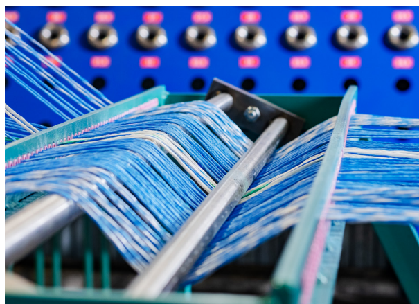
Figure 3. Manufactured since 1772, Timm ropes balance durability, abrasion resistance, tensile strength and elongation.

Another welcome facet of MEG4 is the emphasis it places on a human-centred design. Bringing the day-in and day-out experiences, and most importantly safety, of crew and port workers back into sharp focus, the guidelines encourage manufacturers to always have the end-user in clear sight. Wilhelmsen already adheres to a 'human-centred' mentality with regards to rope design and manufacture. The close to seven-year research and development journey the company embarked on to develop its snap back arrestor (SBA) is evidence of this.